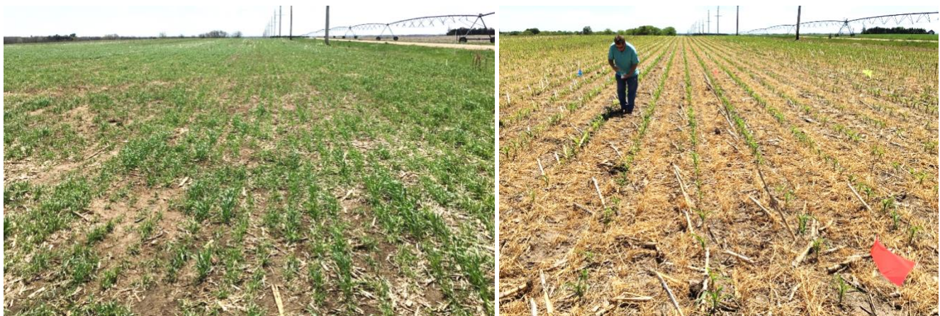
Figure 1. Cover crop post-grazing regrowth on May 4 at time of termination (left) and corn growing in terminated rye on May 25 at time of hand application of ammonium sulfate (right).

This study tested three rates of nitrogen sidedress applied as ammonium sulfate (21% N, 24% S). Ammonium sulfate was applied on May 25 at V4. For analysis, two rows of 15 foot length were hand harvested, shelled, and weighed.