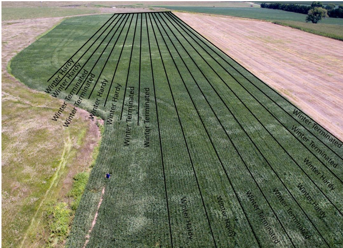
Figure 1. True color drone imagery from July 24, 2018 of soybeans planted after winter-hardy and winter-killed cover crops.

‡Marginal net return based on $7.40/bu soybean, $12.48/ac winter terminated cover crop seed mix, $12.45/ac winter hardy cover crop seed mix, and $14.40/ac drilling cost.