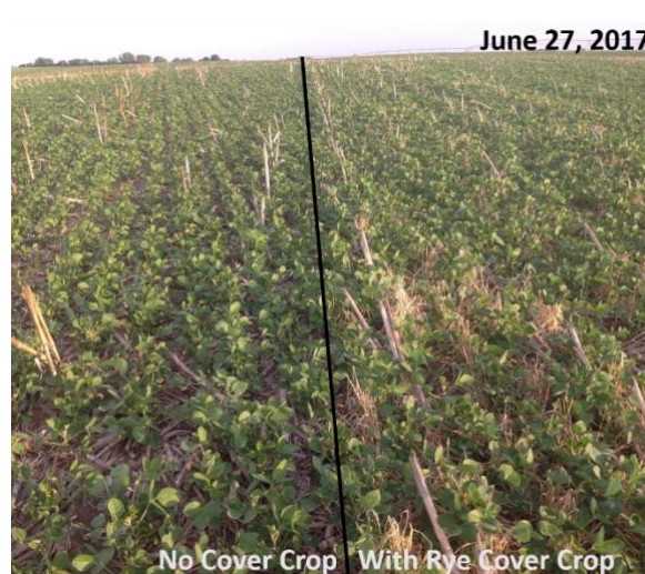
Figure 2. Soybeans growing in corn stubble only (no cover crop) (left) and in rye cover crop (right) on June 27, 2017.