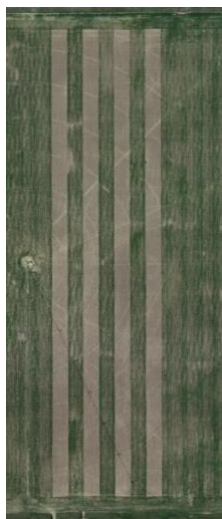
Figure 1. Aerial imagery of the study area from April 19, 2017.

Introduction: This study compared the effects of a cereal rye cover crop on the soybean crop yield. The rye treatment was compared with a no cover crop check. Rye was drilled following corn harvest in 10" rows on Nov. 1, 2016. The rye was terminated with glyphosate on May 5, 2017. Soybeans were drilled in 10" rows on May 8, 2017. The satellite imagery from April 19, 2017, shows the rye and no rye strips prior to termination (Figure 1). A close-up is shown in Figure 2.