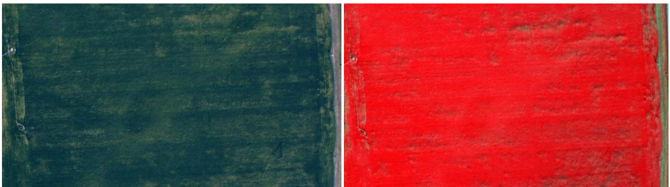
Figure 1: False-color (left) and true-color (right) imagery of the plot area.

‡Net Return based on $8.90/bu soybeans, $12.00/ac Poncho/VOTiVO treatment cost, and $26.00/ac Poncho/VOTiVO and ILeVO® treatment cost.