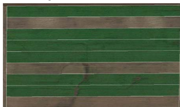
Figure 1: Aerial image of cover crop study area on Oct. 14, 2014.